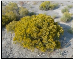
Rabbitbrush in the fall