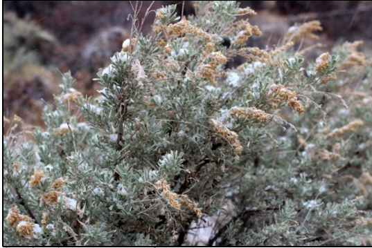
Sagebrush ( Artemisia tridentata )

Sagebrush is found all along the trail; eleven varieties grow in the area. Be sure to smell it! Rabbitbrush, budsage, willow, and a variety of forbs and grasses also grow along the trails. Wildflowers bloom from March through October, with the peak in May.